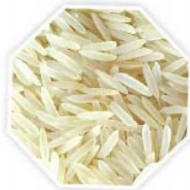
1121 White Sella