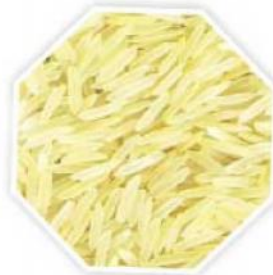
1121 Golden Sella