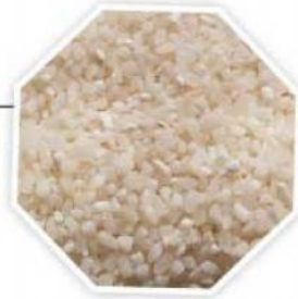
Broken Rice (Parboiled)