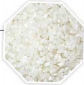
Broken Rice (White)